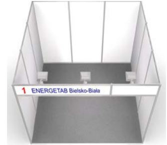
Standard booth layout with example equipment

Example of the standard booth arrangement without equipment